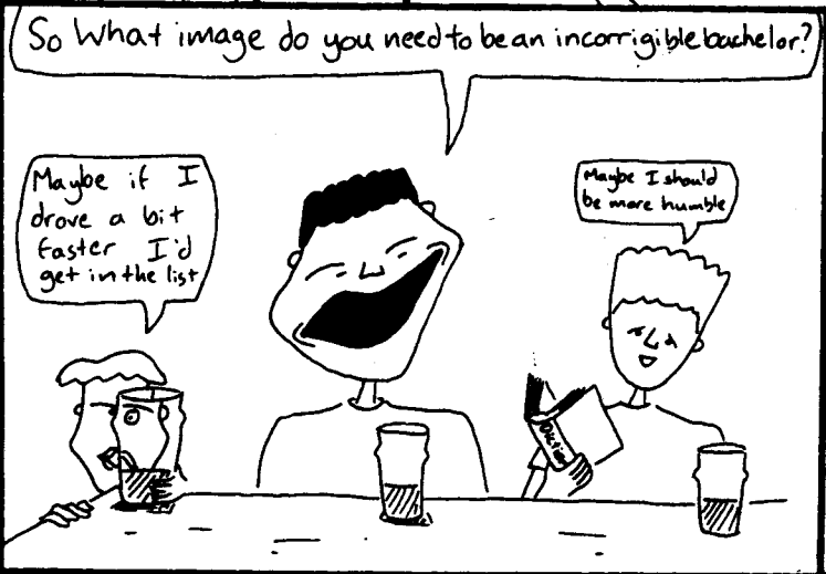
Image and the letter 'e'

So what image do you need to be an incorrigible bachelor?